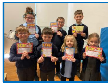
Our Star of the Week winners.

We just wanted to take this opportunity to say a big THANK YOU for all your support in our fundraising efforts so far this year. We raised £206.58 for the Poppy Appeal and £122.48 for Children in Need.